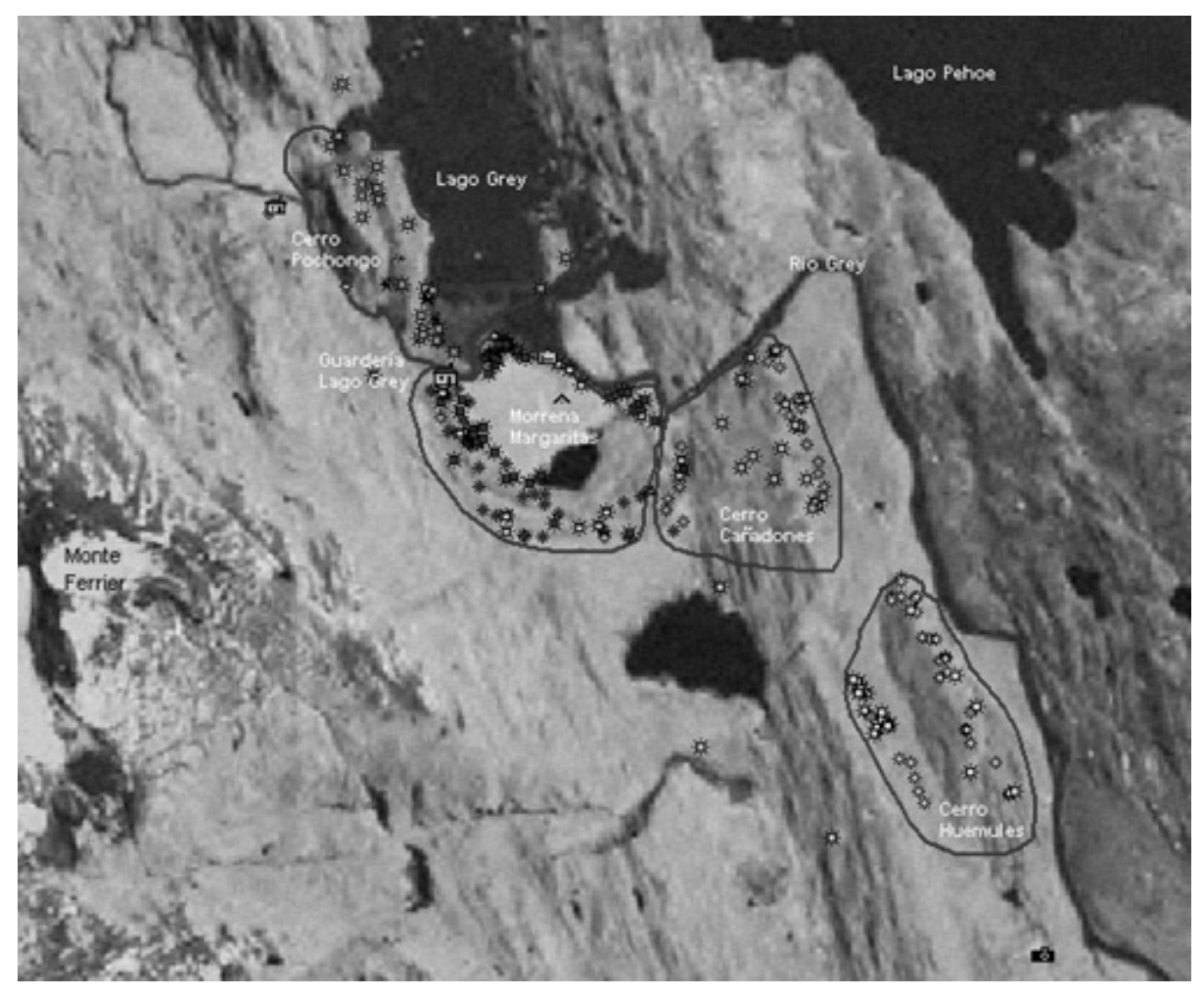
Fig. 2. Encircled areas show huemul main study sites at Lago Grey Sector in Torres del Paine National Park, Magallanes, Chile. Each dot represents a group observed at different times.

Paine National Park in the mid-1980's, and also based on Ortega's experience with trapping whitetailed deer fawns in his doctoral research project in Texas, USA, in the late 1980's. Pictures were taken of every animal observed from 2002 to 2009. This allowed us to identify 47 huemuls during the study: 11 females, 15 males, 5 yearlings and 16 fawns. Although huemul fawns do not have white spots, they are easily recognized by size (up to 11 months). Similarly, yearlings between, 12 and 24 months were recognized by their size. Males were recognized by the development of their antlers. We identified young males from two to three years of age by their slightly smaller antlers and thinner bodies as compared to adult males.