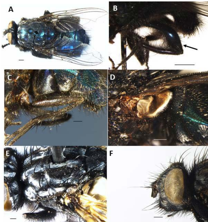
Fig. 3. A. Neta chilensis body (scale bar = 1.0 mm). B. Neta chilensis hind femur hairy (scale bar = 1.0 mm). C. Sarconesiopsis chilensis hind femur straight (scale bar = 0.5 mm). D. Sarconesiopsis chilensis lower calypter dark brown (scale bar = 0.5 mm). E. Sarconesia versicolor postpronotal lobe with four setae (scale bar = 0.1 mm). F. Sarconesia versicolor palp and first flagellomere (scale bar = 0.5 mm).