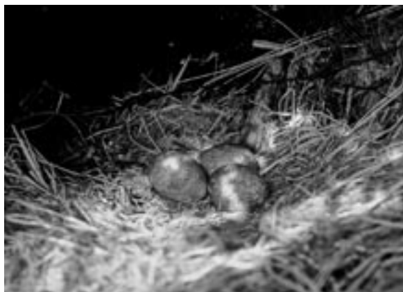
Fig. 3. Nest and eggs of Striated Caracara at isla Noir.