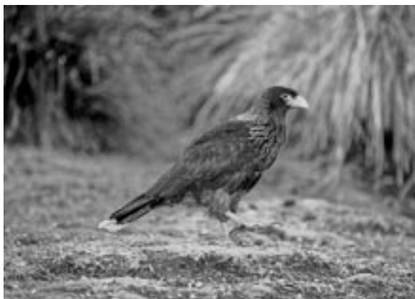
Fig. 2. Adult Striated Caracara ( Phalcooboenus australis ).

In accordance with previous observations on the species, we mainly observed the Striated Caracara directly associated with colonial birds or mammals (see also below). However, the observations with no association to a colonial bird or mammal, e.g., Woodcok Island, Agostini Sound, Condor Bay, Hornos Island, either penguins, cormorants or marine mammals colonies were within short distance. The only main exceptions were the two "inland" records at Estancia [Pto.] Consuelo and at Laguna Amarga, both in prov. Última Esperanza. Along the Chilean territory, all observations of Striated Caracaras involve from one to four birds; exceptionally large numbers have been reported in association with