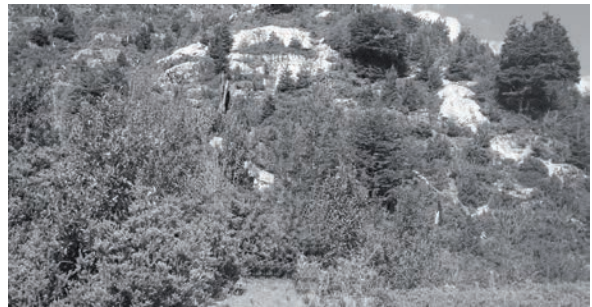
Fig. 3. Habitat of Stenocader mapu Carpintero & Montemayor (2008), Piedra del Águila, Futaleufú, Chile.