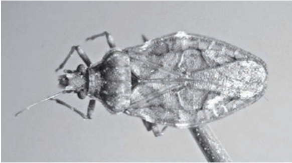
Fig. 1. Stenocader mapu Carpintero & Montemayor 2008, female from Chile, habitus.